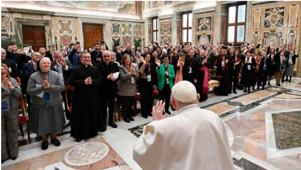
Pope Francis greets participants in the conference